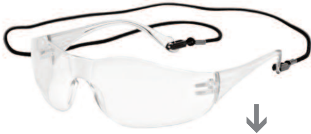
Stealth Hybrid™ ASA450-151-102

Stealth Hybrid™ offers eye protection in the form of a safety spectacle as well as safety goggles. With side arms attached the Stealth Hybrid™ is a safety spectacle providing protection to 1F standard and with the strap attached it is a safety goggle providing protection to the 1B standard. Both offer protection from UV, as well as increased dust and airborne particles compared with a standard safety spectacle.