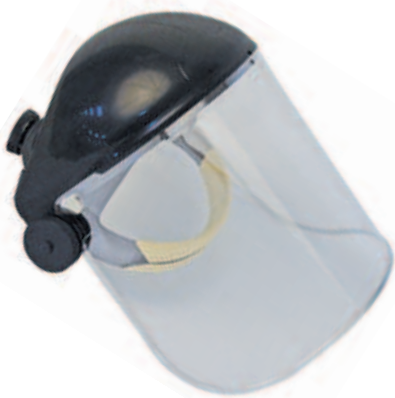
Invincible® Black Browguard Polycarb Bound (8"/20cm) AFA061-131-100

Ear Defender SNR=30 Ear-Defender conforms to EN 352-1 SNR 30. Visor conforms to EN1731