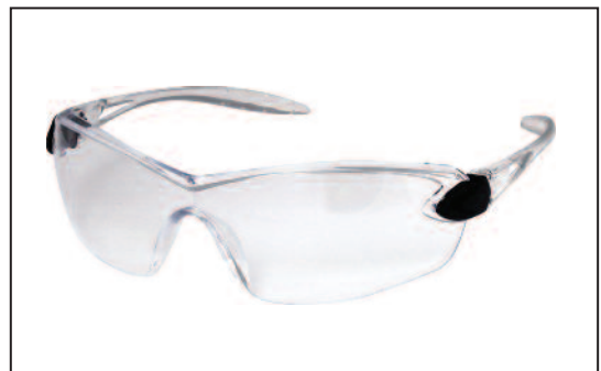
Riga Safety Glasses S907-RIGA

Engineered to be light weight and comfortable, the new Riga™ safety glasses incorporate a modern and stylish curvature design, wraparound style and hard coated lenses for added service life and improved scratch resistance. An internal brow guard and quick release sidearms for lens interchange. Anti-fog treated. The Riga™ comes with detachable foam gasket, detachable side arms and interchangeable strap as standard.