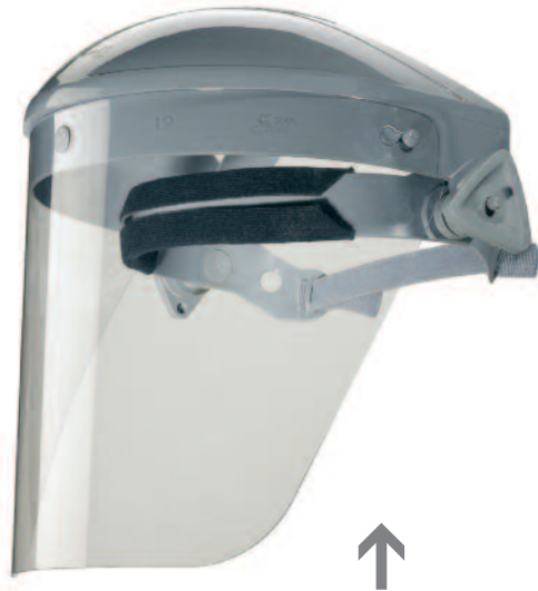
Martcare® Faceshield AFM061-230-400

Browguard with grey/unbound polycarbonate visor and elasticated headband. Conforms to EN 166.1.B.3.99