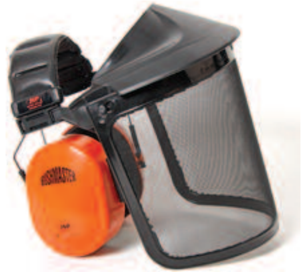
Bushmaster™ Classic Extreme Ear Defender c/w 20cm Wire Gauze Visor

Browguard with grey/unbound polycarbonate visor and elasticated headband. Conforms to EN 166.1.B.3.99